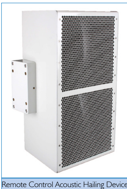
Remote Control Acoustic Hailing Device