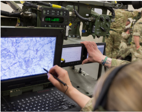
Communications Simulator (ComSim)