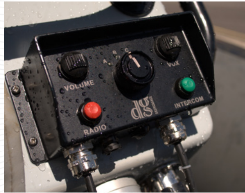
Diamond Intercom & Radio Combiner System