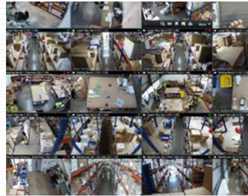
Video Management Solutions